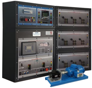
AEL-EPP Energy Power Plants Application