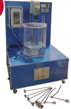
PEAIC Computer Controlled Aeration Unit