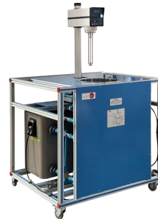
VPMC Computer Controlled Multipurpose Processing Vessel