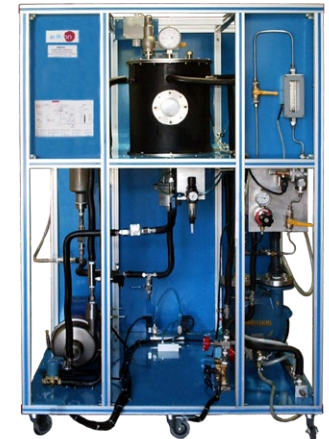
AEHC Computer Controlled Hydrogenation Unit