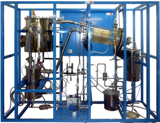
QEDC Computer Controlled Batch Solvent Extraction and Desolventising Unit