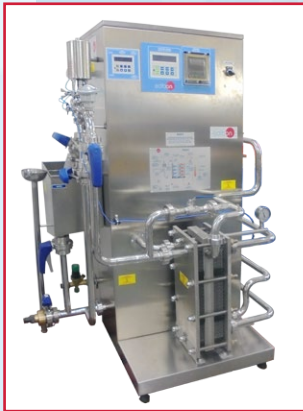
PADC Computer Controlled Teaching Autonomous Pasteurization Unit