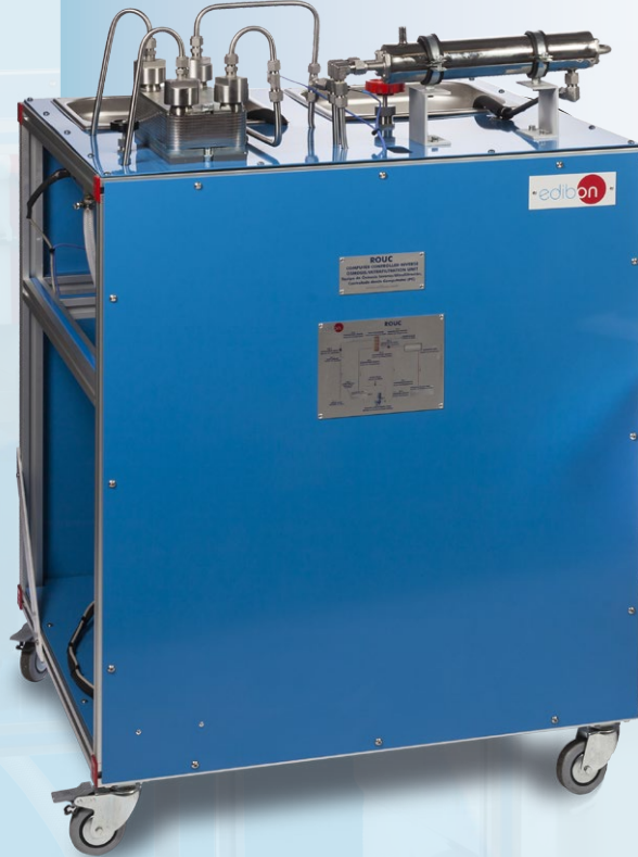
ROUC Computer Controlled Reverse Osmosis/Ultrafiltration Unit