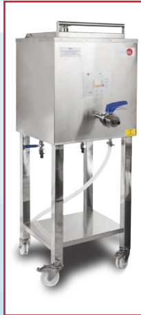
RDC Computer Controlled Teaching Cottage Cheese Maker