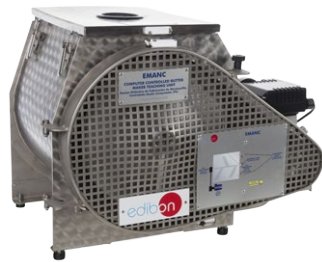
EMANC Computer Controlled Butter Maker Teaching Unit