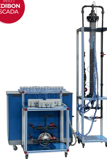
EFLPC Computer Controlled Deep Bed Filter Unit