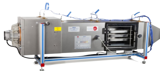
SBANC Computer Controlled Tray Drier