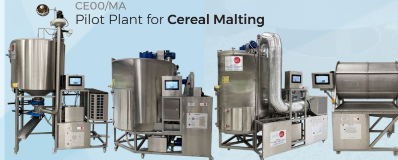
CE00/MA Pilot Plant for Cereal Malting