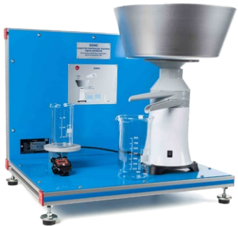
DSNC Computer Controlled Teaching Cream Separator