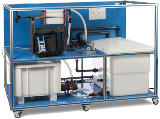
AFPMC Computer Controlled Plate and Frame Filter Press