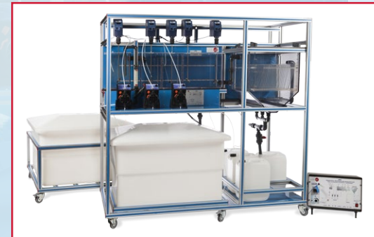
SPFB Sedimentation, Precipitation and Flocculation Unit