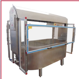
CCDC Computer Controlled Teaching Curdling Tank